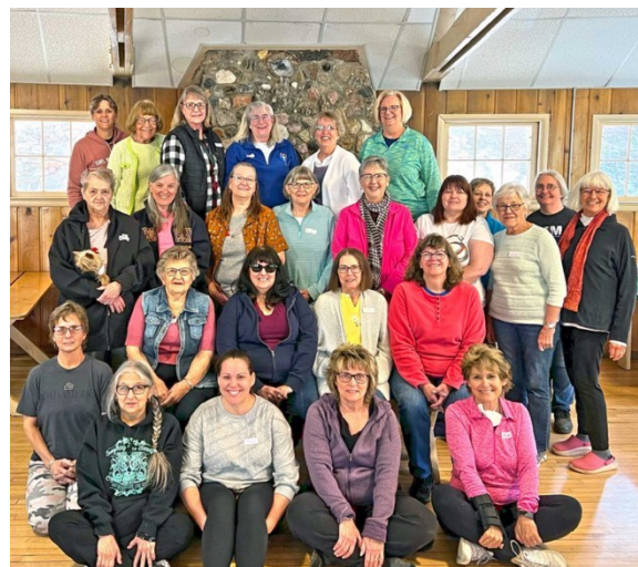
Pictured: Spring Mennonite quilters of 2022 joined together from as close as Woodland Park & Florissant to as far away as California & Georgia.